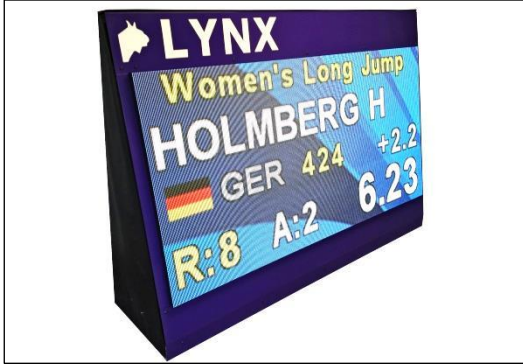
Live Field Event or Race Results