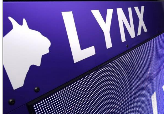
Custom-Built Aluminum Frame