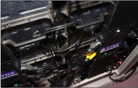
Weatherproof Internal Connections